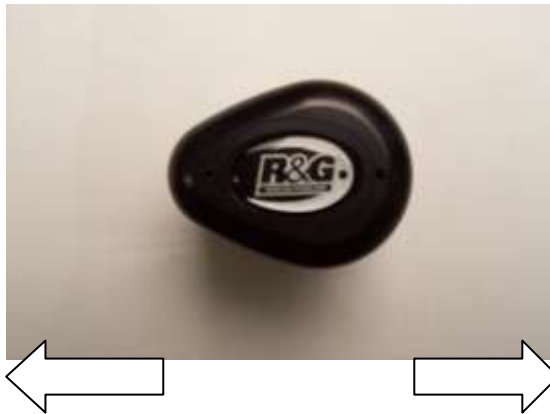
REAR OF BIKE