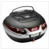
E96 - PORTAPACCHINO MAXIA NERO