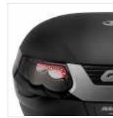
E112 - KIT LUCI STOP VALIGIA E55