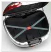
E114 - RIVESTIMENTO INTERNO