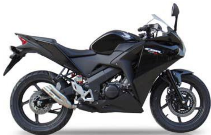
HONDA CBR 125 '12