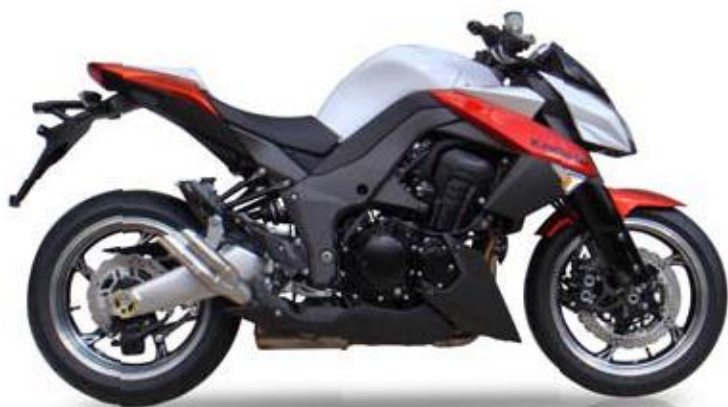
KAWASAKI Z1000 10-13