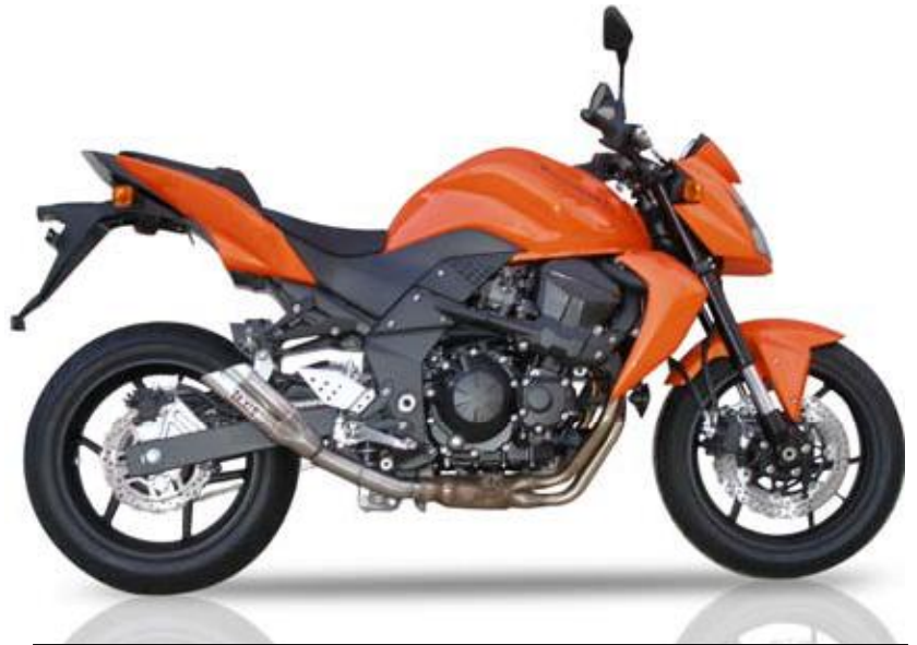
KAWASAKI Z750 07-12