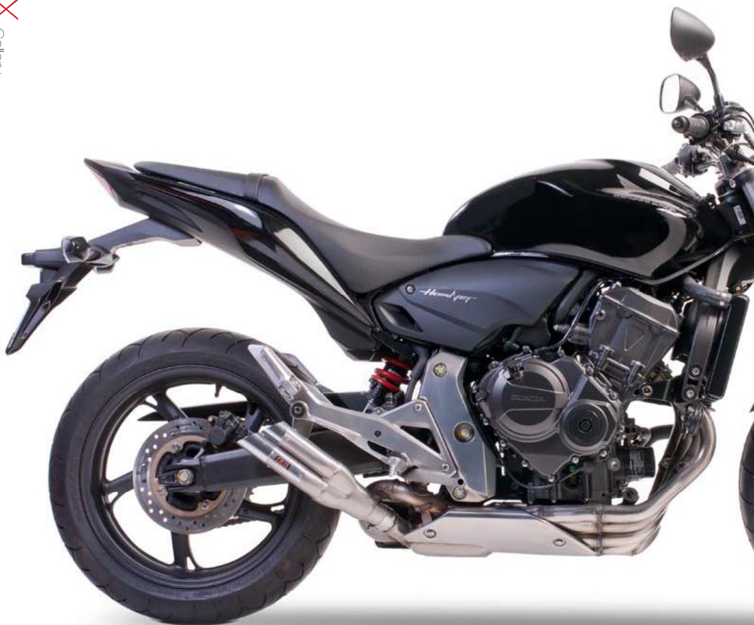
HONDA CB 600 F HORNET