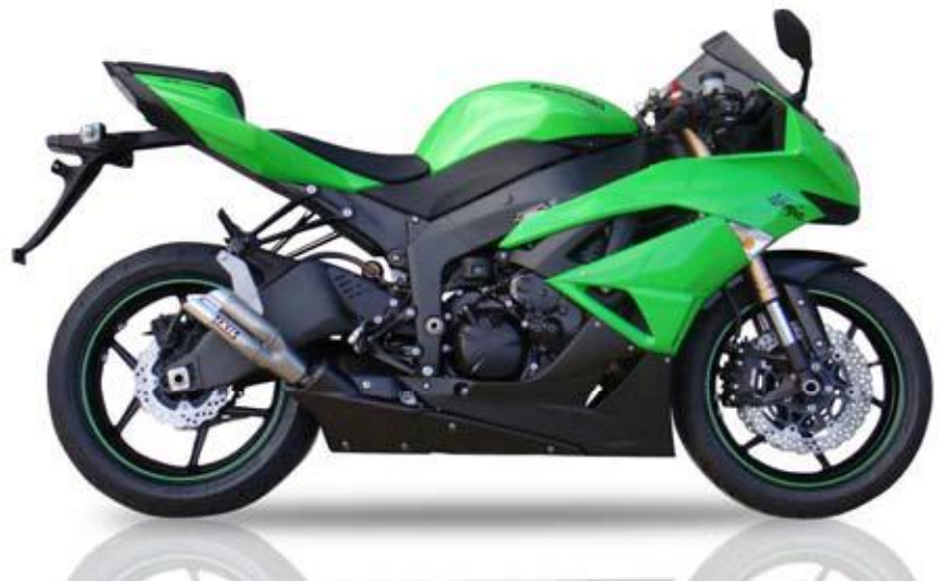
KAWASAKI ZX6R 09-13