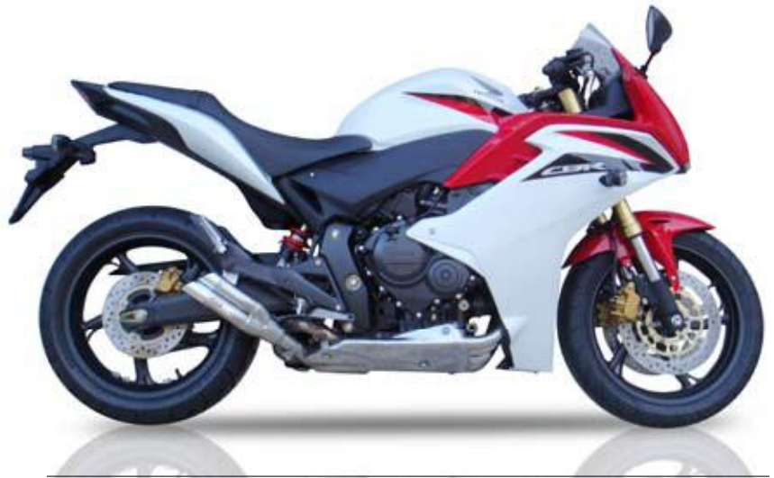
HONDA CBR 600 F '12