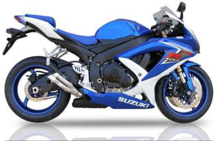
SUZUKI GSXR 600-750 08-10