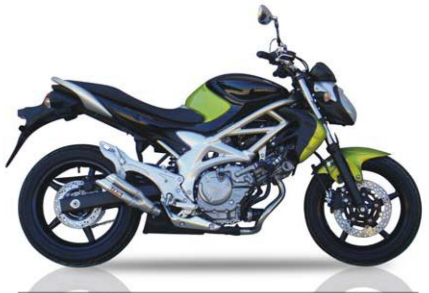
SUZUKI GSF 650 GLADIUS