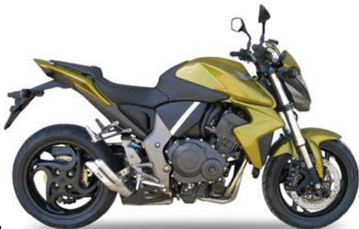
HONDA CB 1000 R