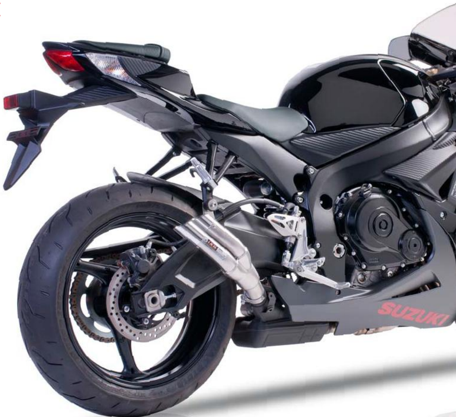
SUZUKI GSXR 600-750 11-13