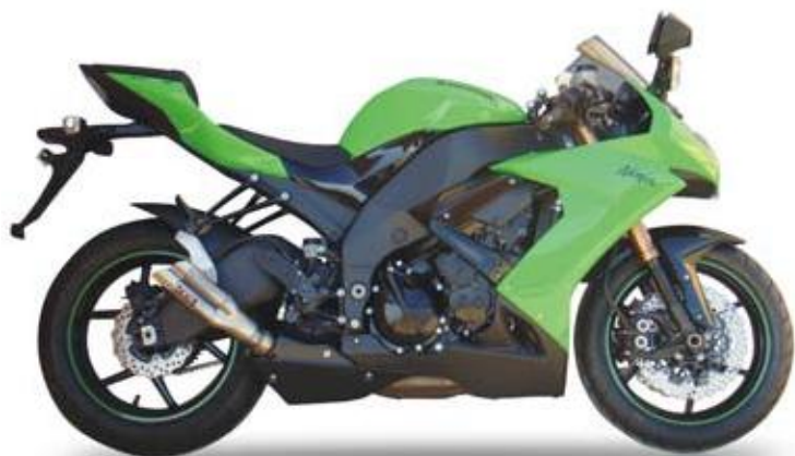
KAWASAKI ZX10R 08-10