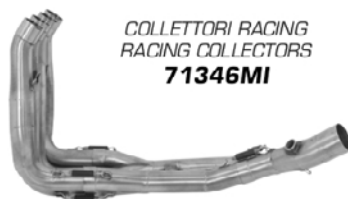
COLLETTORI RACING RACING COLLECTORS 71346MI

EUROPEAN UNION TITANIO HOMOL. 71628PR RACING TITANIUM PRO-RACING 71028PR