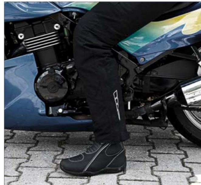
Nachher | After