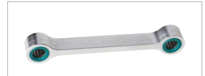
TYP | TYPE 06

Mit Verlängerung für den Seitenständer | With stand extensions