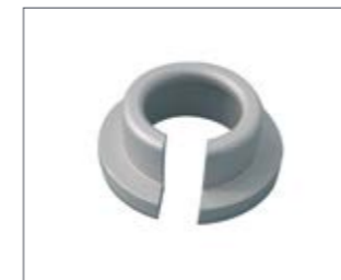
TYP | TYPE 10