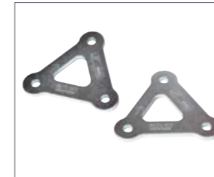
TYP | TYPE 01