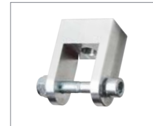
TYP | TYPE 07

Mit abgedichteten Nadelhülsen, die über eine hohe Tragfähigkeit verfügen | With high load capacity sealed needle roller bearings