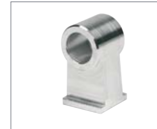
TYP | TYPE 02