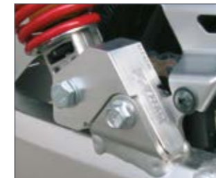
TYP | TYPE 04

Mit Verlängerung für den Seitenständer | With stand extensions