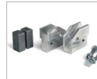
TYP | TYPE 05

Mit Verlängerung für den Seitenständer | With stand extensions