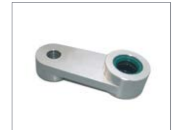
TYP | TYPE 09