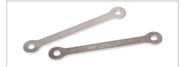
TYP | TYPE 03