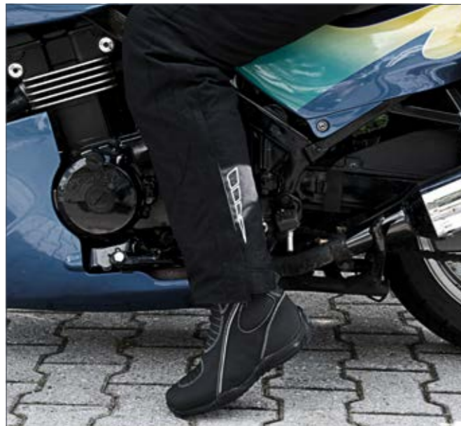
Vorher | Before