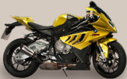
Suitable for BMW S1000RR